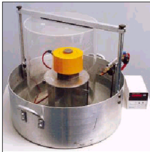
Figure C-2 The practical set-up